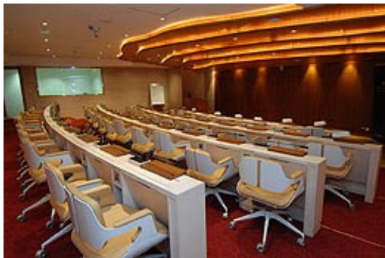
LECTURE THEATRE