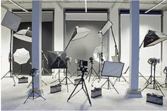
STUDIO EQUIPMENT