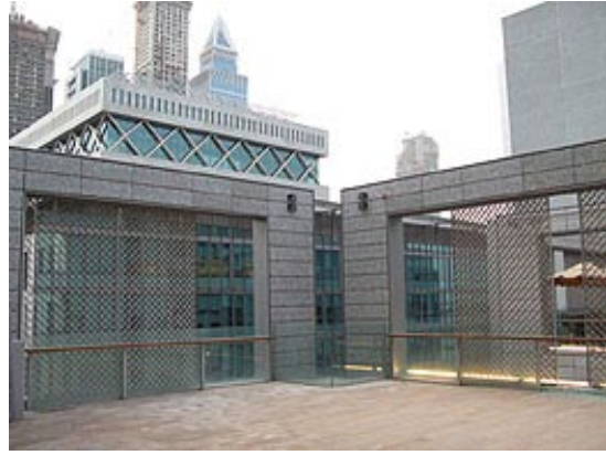
OUTSIDE STUDIO / © Spéos