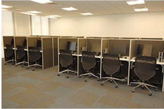
COMPUTER LAB