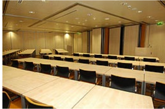
LECTURE ROOMS / © Photos DIFC